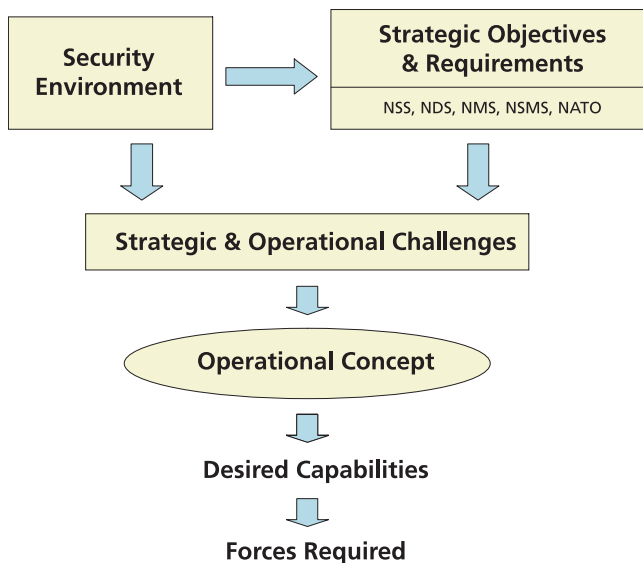
FIGURE 1 PLANNING METHODOLOGY AND PROCESS

Note: An expanded view of the third box in Owens, "Strategy and the Logic of Force Planning," fig. 2, "The Logic of Force Planning," p. 490.